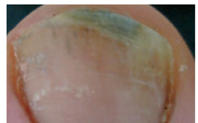
5 months after