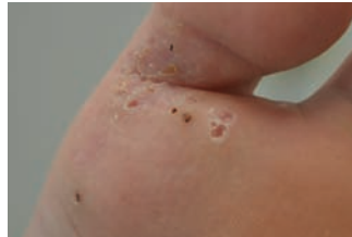
4 weeks after 1 treatment