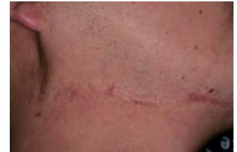
4 weeks after 7 treatments